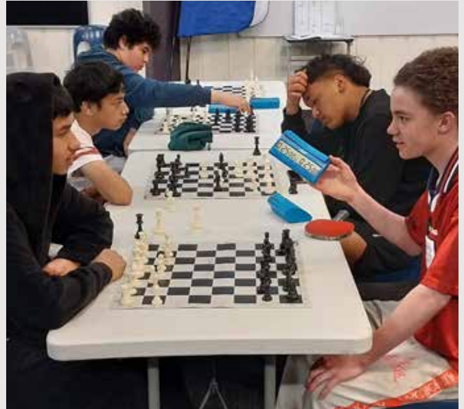
Kaiti Kings Chess Club members battle it out every Thursday night at Ilminster Intermediate Hall.