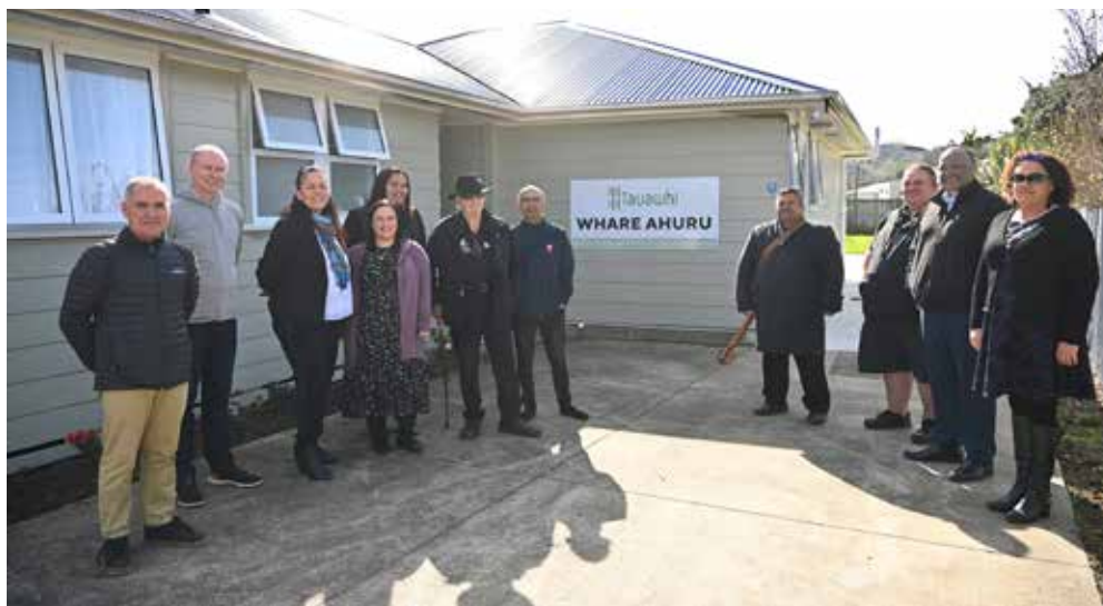
Tauawhi Men's Centre opened Tauawhi Whare Ahuru last year as part of their outreach services for men who are struggling to maintain a violence-free lifestyle.

Any donation made to Tauawhi Men's Centre Endowment Fund will support them both now and for years to come.