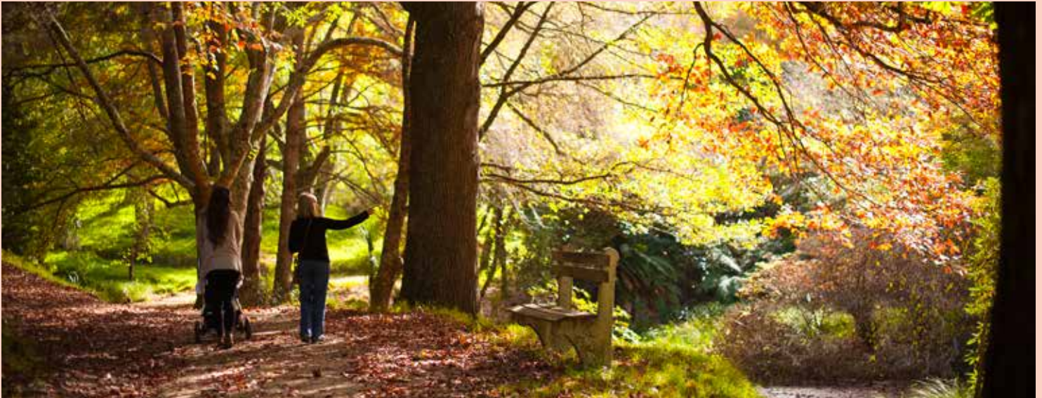
Take a family trip to Eastwoodhill over Autumn to enjoy the beauty of the leaves changing colour.

If you donate to Eastwoodhill's Endowment Fund before March 31 you will receive 1/3 of your donation back as a tax rebate. To read more about the fund or to donate, please visit our website. Donations of any amount are appreciated and collectively make a difference.