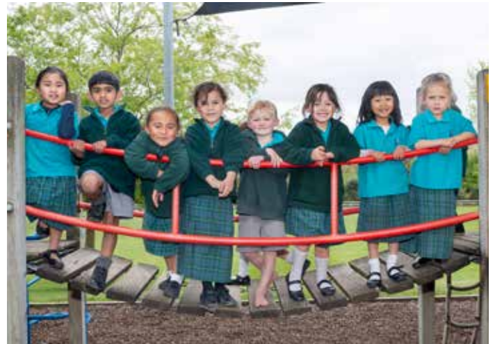
The St Mary's Catholic Primary School Endowment Fund will benefit children from families who are struggling financially to participate fully in the life of the school.

All donations to the St Mary's Catholic Primary School Endowment Fund will be invested, protected, and grown to keep up with inflation. The surplus investment income will be returned to St Mary's every year forever. If you would like to support the new fund, please visit the 'Donate Now' page on our website.