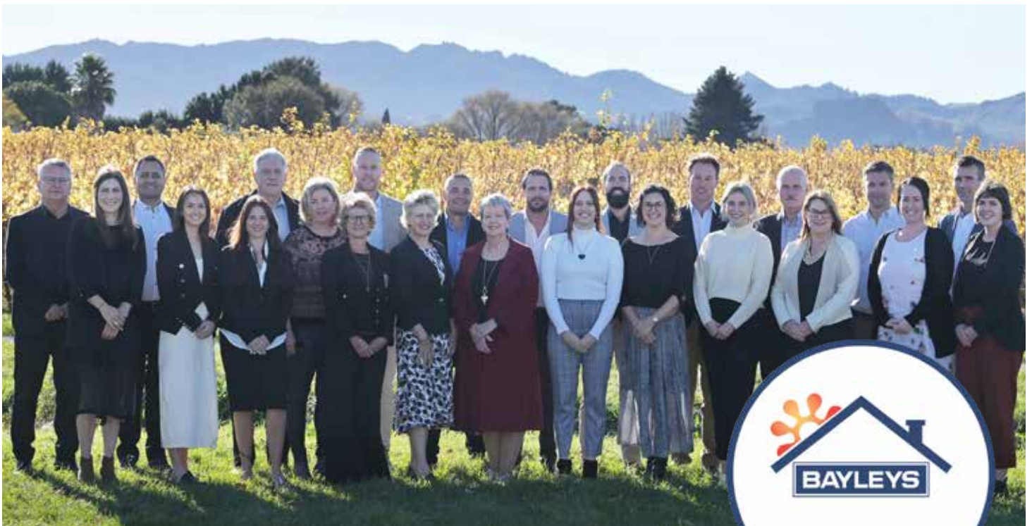
The Bayleys Gisborne team love supporting our community and will do so again by donating to Sunrise for every property sold in July and August. You relocate and they will donate!