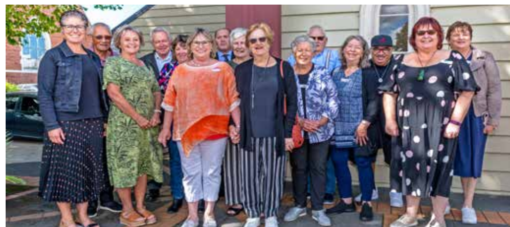
Pictured above are some of the staff, volunteers, funders and stroke survivors who met to celebrate Stroke Tairāwhiti's 35th birthday and recent amalgamation with Stroke Foundation New Zealand.

Whether you donate $5 per week through regular giving or prefer a larger lump sum donation – every little bit really does make a difference, and we thank you for your generosity. From 1 April '22 through to 31 March '23 we had over $1.1 million donated, bringing total funds invested to over $7 million. Ngā mihi nui!